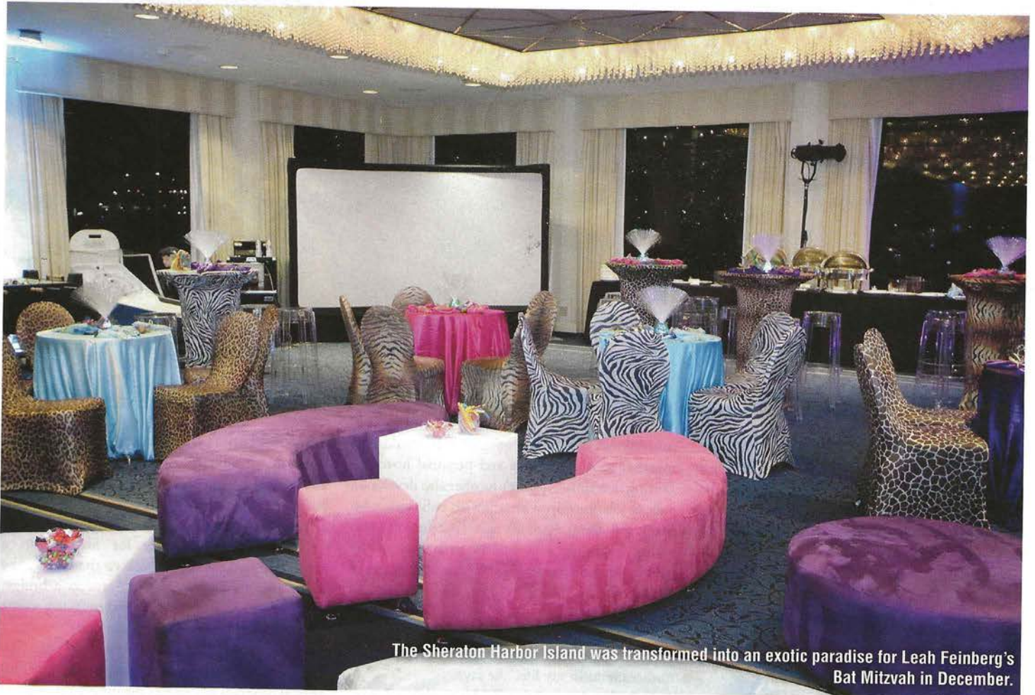
The Sheraton Harbor Island was transformed into an exotic paradise for Leah Feinberg's Bat Mitzvah in December.